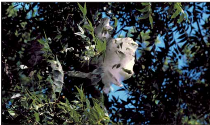
Tightly woven fall webworm web.

The feeding preferences of fall webworms vary from one place to another. In west Texas, mulberry, poplar and willow are preferred; oak, hickory and pecan are most often attacked in east Texas.