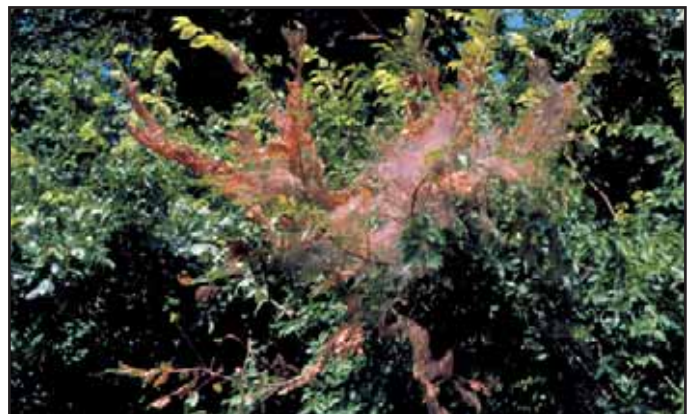
Loosely woven web.

Larvae of the orange race have orange heads and orange tubercles, while larvae of the black race have black heads and tubercles.