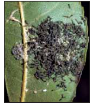
Newly hatched fall webworm larvae.

portions of tall trees. Because webworm larvae remain inside their webbing, insecticide sprays must penetrate the web to be effective. For best control, apply insecticides after eggs hatch and before larvae develop dense webs. Insecticides containing Bacillus thuringiensis ( Bt ), carbaryl (Sevin®), chlorpyrifos (Lorsban®), malathion, tebufenozide (Confirm® 2F), spinosad (Spintor®), and methoxyfenozide (Intrepid® 2F) are effective. Insecticides containing Bt , tebufenozide and spinosad are selective for caterpillars and do not harm beneficial insects; however, they must be applied when caterpillars are small for effective control.