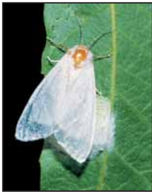
Adult laying eggs.

The larvae begin to build a silk web soon after hatching. As larvae consume leaves within the web, they expand the web to take in more foliage. All larvae within a web are the offspring of a single egg mass. Larvae will molt six or seven times before leaving the web to pupate. The life cycle from egg to adult requires approximately 50 days under ideal conditions.