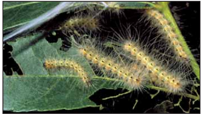
Fall webworm larvae.

If webs are too numerous or too high in a tree to deal with individually, insecticides can be used to prevent damage. Hose-end sprayers or commercial high-pressure sprayers are best for reaching upper