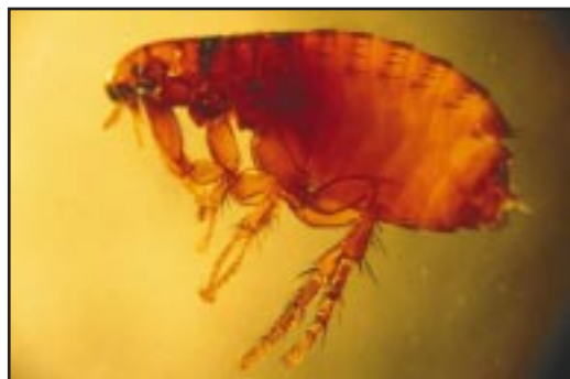
Cat fleas are the most common fleas on dogs and cats. They also infest raccoons, opossums and coyotes.

Cat fleas do not normally live on humans, but do bite people who handle infested animals. Flea bites